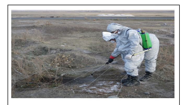
FIGURE 3 | Treatment of test site B with germinants and biocide delivered using a Micropak KS16 backpack sprayer.

Even thought the level of natural B. anthracis spore contamination at test site B was relatively low we wanted to take advantage of this unique opportunity to generate real world data. Thus test site B was treated with a regimen comprising a mixture of germinants followed 1 h later by PAA at a concentration of 5000 ppm which was the maximum concentration permitted by the Turkish authorities, delivered using a back pack sprayer ( Figure 3 ). An advantage of this system is the ability to specifically target the delivery of the